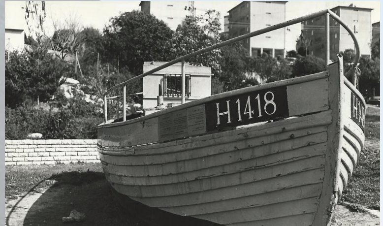
Hundreds of people were smuggled across the water to Sweden, often in Danish fishing boats like this one.

Many families were very brave as they hid Jewish friends in their houses, like the Johansens did with Ellen, until they could help them escape Denmark. Members of the Resistance successfully smuggled over 7,000 of Denmark’s nearly 8,000 Jews out of the country into Sweden on fishing boats, thereby protecting them during the rest of the War until they could return home.