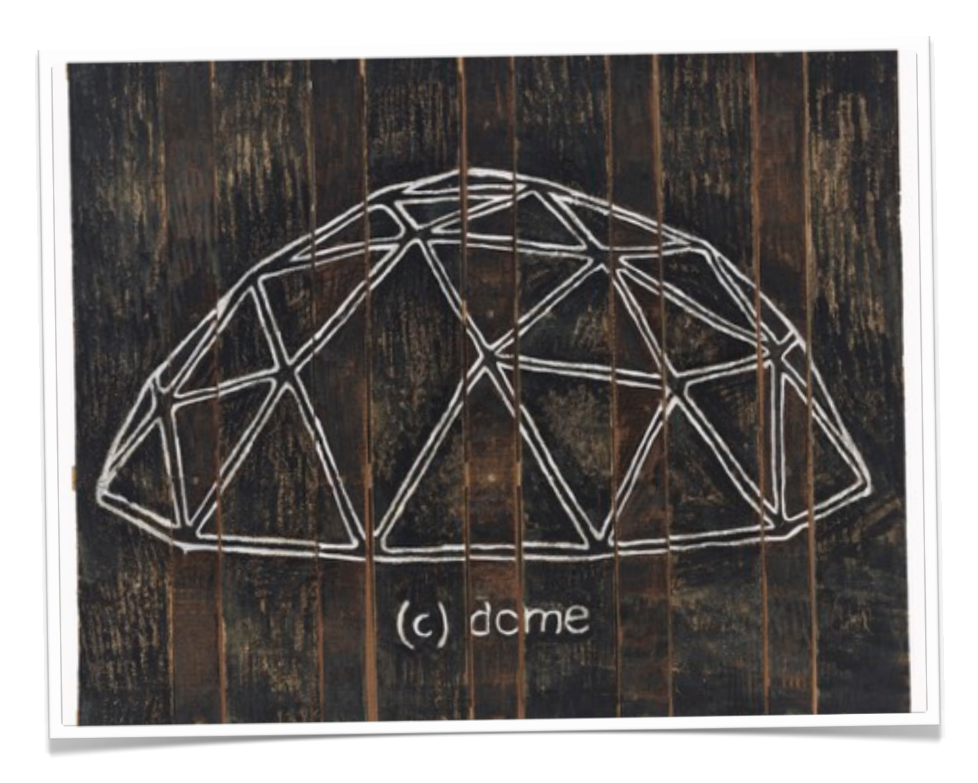
Dome, 2015, wood pallet, cardboard, roofing nails, charcoal, enamel and beeswax, 40" x 47"

Though the imagery I feature in my work may seem varied --the transmission towers, the topographical maps and the appropriated line drawings-- together they create a composite picture of the concept of "home." ... Compounded with the content imparted through the representational imagery is the meaning imbued within the sourced, recycled, utilitarian and throwaway materials I employ. Ephemeral media like brown paper lawn refuse bags and cardboard contribute to a "here today, gone tomorrow," fleeting sense of place and time. But, home is not just a place of fondness and memories; it's also the conflation of landscape, labor and socioeconomics that lay the groundwork of identity. --Robin Dluzen