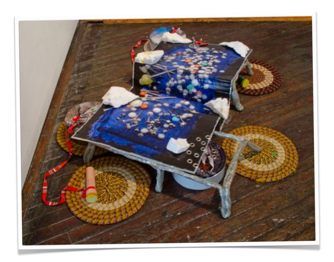
Harbinger, 2012, mixed media

For Melissa Pokorny, found objects constitute the starting point for elaborate sculptures that have explored gender roles, the public and private spheres, and the nature/culture divide. More recently, her work engages the connection between "things" as potent containers of memory, capably representing loss and estrangement, and the deeply haunted landscape of the everyday. Unremarkable objects become activated and heightened as they are positioned within larger tableau. The compulsion to collect, the status of marginal objects and things, and speculative connections result in fractured narratives that address these occulted objects, the allure of magical thinking and the collapse of the boundaries between the animate and inanimate.