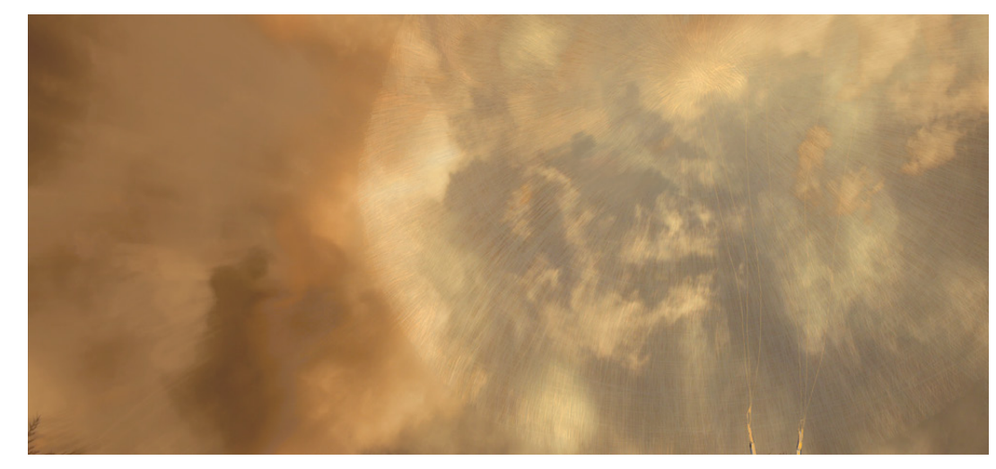
Anne Stevens horizontal descent 2010 36x72 drawing into photograph limited edition archival pigment print

2. Anne Stevensslit201172x72 drawing into photograph of painting limited edition archival pigment print