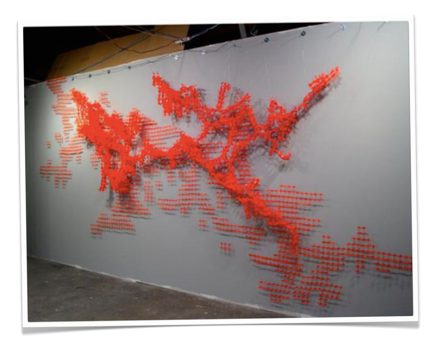
Re-Construction Netting, plastic snow fence, dimensions variable

In terms of my artistic practice, I am a process artist based mainly in sculpture with interests in two-dimensional media. I begin my process with a single repetitive action, such as drawing a series of lines or mass-producing a single material. For me, actions and materials are holy tools which need to be examined before use; through careful examination and use, the divinity of these tools can be known. In my practice I study each of my materials individually through manipulation, creating mono-compositions and testing them so that they support themselves. Once I acclimate this very basic action into my practice, a limited vocabulary emerges, at which point I begin another layer of process. In this next step, I allow the second action to interact with the first, orchestrating materials in space or frame to create a holistic composition. These two steps continually repeat in a spiraling process that may sometimes lead to a chaotic, yet controlled moment. My work is the product of this moment. --Eric Gushee