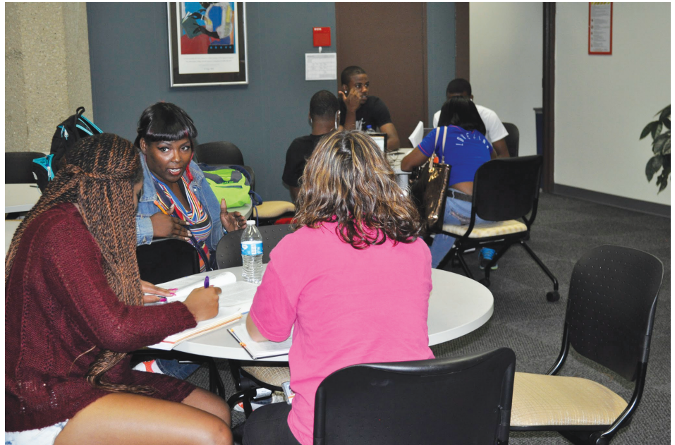
ARC/Writing Center Open House was held on September 18th with a packed house!

To celebrate the new look of the Academic Resource Center, an open house was held on Thursday, September 18. The event introduced faculty and students to the new resources and new facilities. If you haven't yet, visit the new space and use our resources, the Academic Resource Center is open Mondays through Thursdays, 9 a.m. – 7 p.m. and Fridays, 9 a.m. - 5 p.m. in B-1215, off the Hall of Governors.