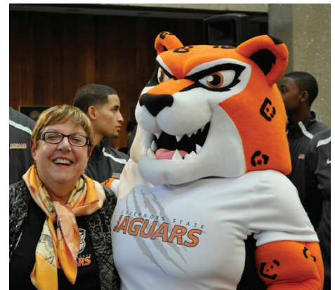
President Maimon with Jax!

The final phase of “Operation Mascot” kicked off on September 6, 2014. This movement encouraged students and the GSU campus community to submit their suggested name for the GSU mascot.