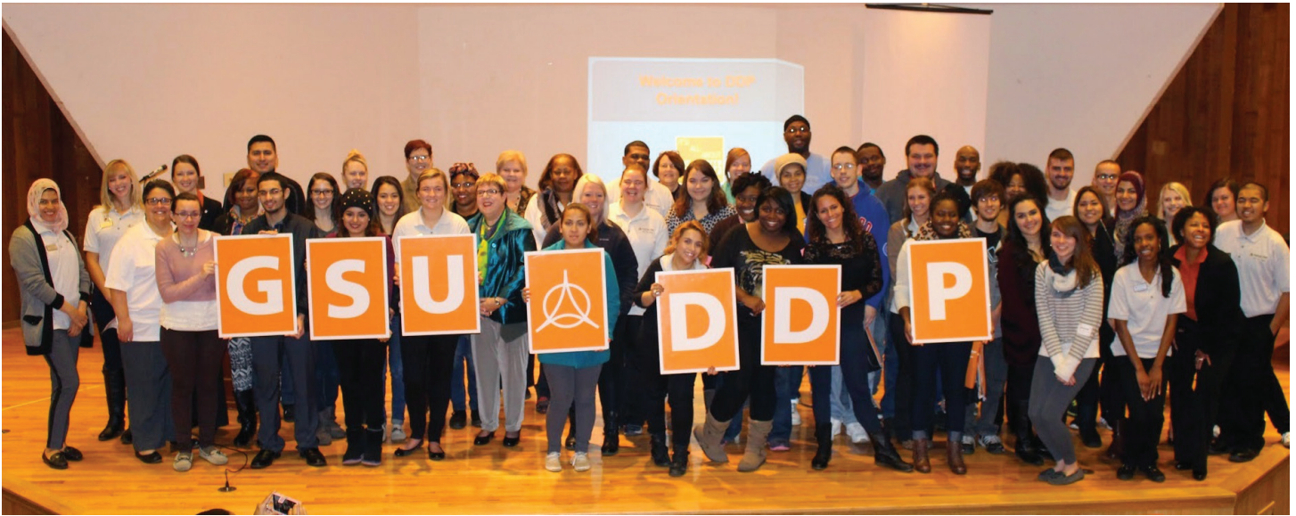
Students from local community colleges participated in DDP orientation on November 7, 2014.