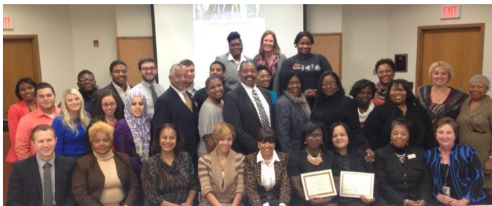
The Certified Executive Officer (CEO) Leadership Certificate Program is designed to provide student leaders of clubs and organizations effective and essential leadership skills.