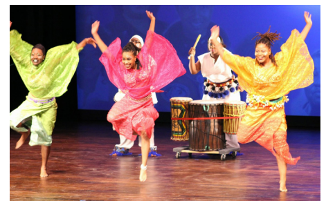
Ayodele Drum & Dance Company