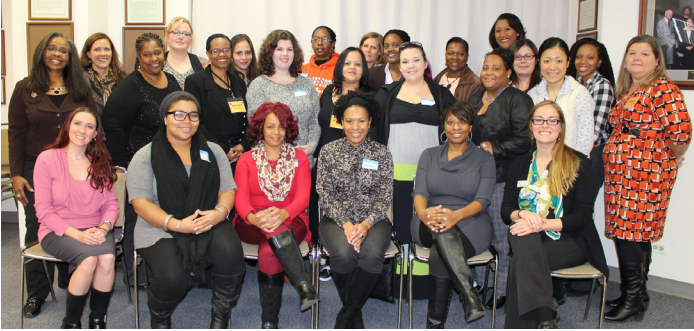
The SHERO Women's Leadership Symposium [S – Sharing, H –Herstory (of), E – Empowerment, R – Resilience (&), O – Opportunity]. The conference is inclusive to all genders looking to support leadership.

On Friday, November 7 eighteen students participated in the first SHERO Women's Leadership Symposium. The goal of the symposium is to inspire women to seek their highest level of personal and professional development. The program provided perspectives and strategies in the areas of personal development, career development and advancement, and community engagement. The conference format included a featured presentation and breakout discussions to celebrate SHERoes and diversity. A student participant stated "I thought the symposium overall was a great training experience. I left there feeling empowered, inspired, motivated, and educated."