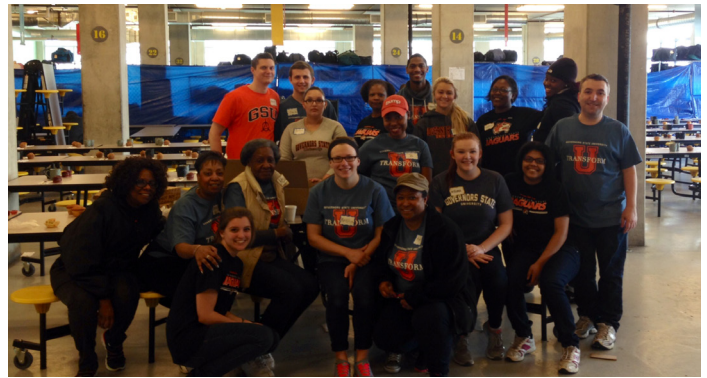
ASB in Chicago at the Pacific Garden Mission, founded in 1877, is a homeless shelter and rescue mission located in the South Loop.

The Civic Engagement and Community Service Center (CECSC) partnered with Break a Difference to organize the first out-of-state Alternative Spring Break, which took place from March 15-21, 2015 in San Francisco, California. Break A Difference is a nonprofit organization with the mission of propelling young leaders on a trajectory of lifelong service by providing immersive community impact opportunities across the globe through alternative break programs. Six students and two faculty members from GSU travelled to the west coast to assist in youth development and instructive activities to support enriching education for youth in the Bay Area.