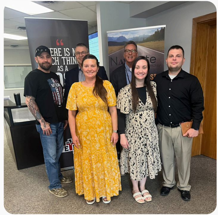
CCCRC attended Recovery Conference in Urbana