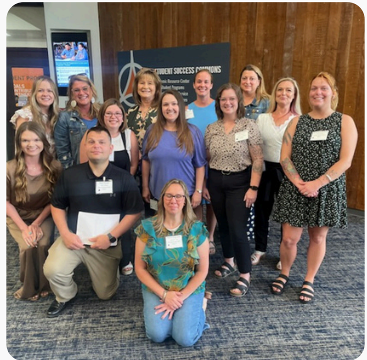
The East Central Illinois ROSC team were in attendance at the Statewide Meeting at Governors State University