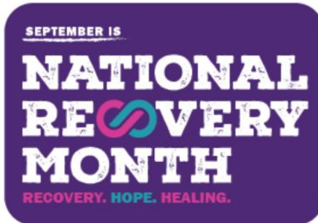
Email Signature 1