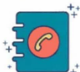
Grief Support Services Directory