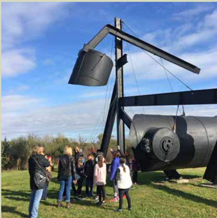
Yes! For Lady Day by Mark di Suvero