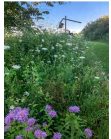
Prairie blooms with House Divided and Yes! For Lady Day