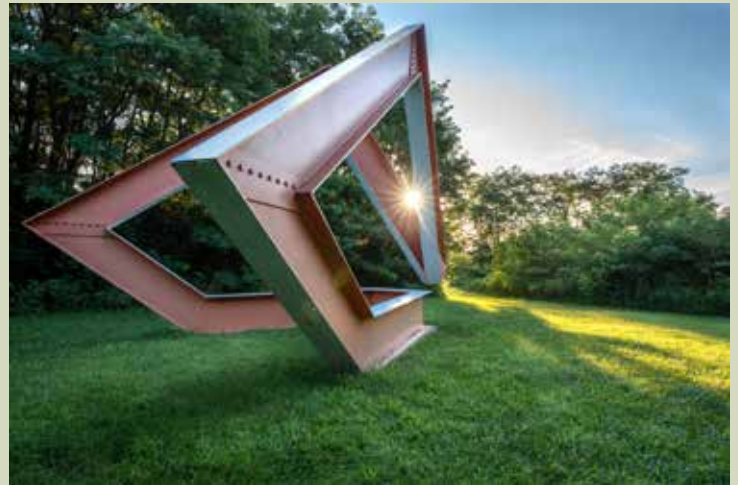
Erin Soto Photography, Phoenix by Edvins Strautmanis