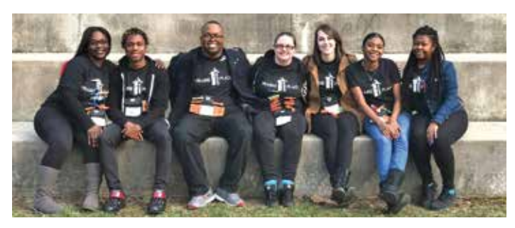
Prairie Place Hall Council Executive Board members.

as conference coordinators, to business meetings, retreats, and the annual conference.