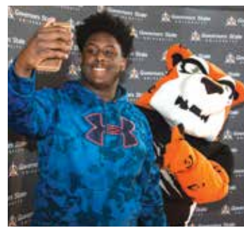
Participants at the Signing Day and Scholars Recognition for the White House Reach Higher campaign.